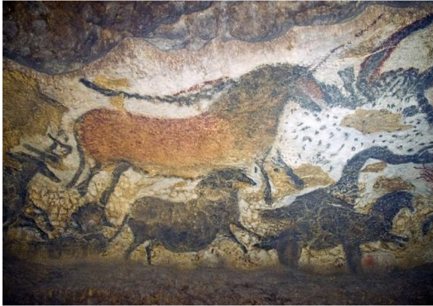
Visual 2. Reproduction of Lascaux artwork in Lascaux II