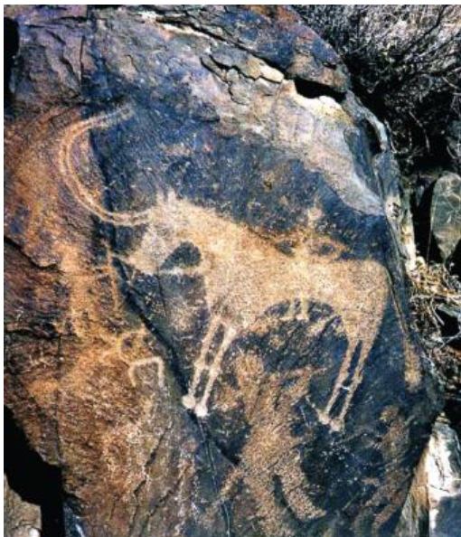
Visual 3. Tamgaly tract. A man on a horse (unicorn).

A whole layer of unique images of horses (and other images and plots) in petroglyphs, small sculptures, etc., made in the "Seima-Turbino traditions" and having a stable iconographic appearance that is easily recognizable in many regions, was distinguished at one time based on stylistic identification with figures on the tops of knives and daggers, as well as sculptural tops of stone wands from East Kazakhstan and neighboring regions (Samashev, 2009).