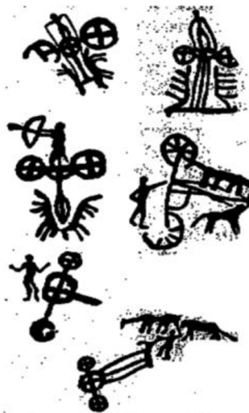
Visual 4. Chariots of the Karatau petroglyphs 2nd millennium BC e.