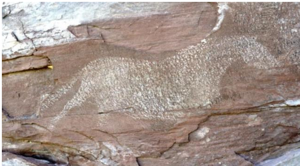
Visual 1. Rock painting "White Horse", Black Mountain, Khakassia, from 17 to 30 thousand years (Ice Age).