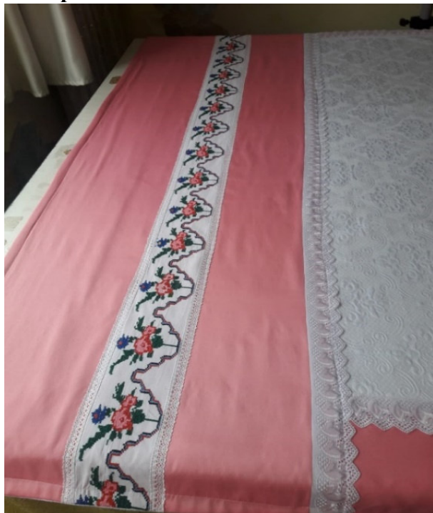
Photograph 1. Bed Cover (Sertçelik, 2019)

Product name: Bedspread Year : 1979 Type : Processing Condition : Robust Purpose of Making : Dowry