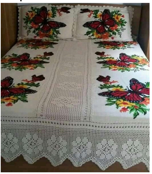
Photograph 6. Bed Cover (Kılıç Karatay, 2019)

Product name : Bed Cover Yea : 1980 Type : Processing Condition : Robust Purpose of Making : Dowry