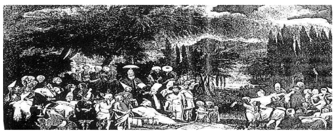
Figure 1. Ceremonies During the II. Ahmet Period (Aliasghari Khabbazi, 2016)

Along with the successively lined Feriye Palaces, Çırağan Palace takes up a 1500 metre long coast line. At the beginning of 20th century, a comprehensive restoration was required for Çırağan Palace and thus, French Dersaadet Legation foreman Antoine Perpinyani submitted a comprehensive scouting report for palace's restoration in 1321/1905 in Mohammedan Calendar. In this scouting report, aside from the great Saray-1 Hümayun; seraglio, ağalar building, tiled pavilion, conservation wall, pier, ağalar building's harbor at Beşiktaş side, pools in the garden, the gates of sultanate at Tramway Street were gathered under 10 headlines. Additionally in Perpinyani's report, Çırağan Palace was designed as 1/1000 scale layout plan whereas seraglio and ağalar buildings were designed as 1/500 scale (figure 2) (Seçkin, 2000).