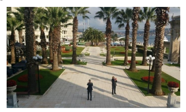
Figure 6. New Çırağan Palace Hotel (Original, 2017)