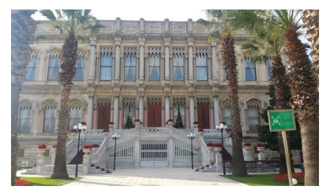
Figure 5. New Çırağan Palace Hotel (Original, 2017)

Today, when looking at the reconsidered landscape design of Çırağan Palace's garden along with the hotel construction, it can be seen that there's no longer a commitment to palace's once had historical features and also with both vegetal arrangement and choice of urban furniture's, contemporary applications and objects are totally replaced its ancestors.