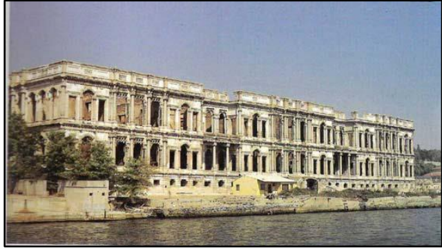
Figure 4. Aftermath of the fire, Çırağan Palace's view from the sea before its transformation into a hotel (Mutlu, 2006)

In 1987, an international tender were initiated for the long forgotten palace and its garden. Renovated to be transformed into a hotel as a consequence of the tender, the structure was reopened in 1992 and today it still serves as a hotel. On 19 January 1910, the palace became history with fire and was taken into restoration in 1986 under the responsibility of Yüksel Building Company. During the restoration process, the palace brick walls with a floor area of 43x123 m were completely demolished and the 22 m. high walls were reinforced by the "shotcrete" method. Outside of the facade restoration, the four marble reign stairs and the palace's Hünkâr Hamamı (sovereign hammam) have been restored with partial repairs. The damaged dome of the hammam was removed and 63 skylights and 2 dome were built as reinforced concrete. The stone parts of the bridge connecting the palace and the Yıldız Park were repaired and the polluted parts were cleaned. The "Reign", "Harem" and "Sofa" doors made of Marmara marble were cleaned and the missing