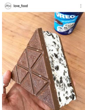
136.505 beğenme love_food Toblerone & Oreo ice cream sandwich! 🍪 #lovelfood