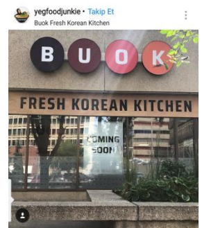
152 beğenme yegfoodjunkie Walking to @tasteofedm and came upon @buokfresh. We peered in and got invi... devamı 11 yorumun tümünü gör eatyourheartoutyeg Looks good, can't wait!