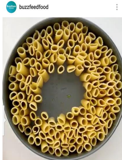
195.670 görüntüleme buzzfeedfood Round and around we go 🍝 #buzzfeast