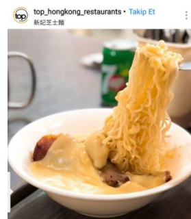
687 beğenme top_hongkong_restaurants #topcitybiteshk // Grilled Pork Neck Instant Noodles with Cheese... devamı 13 yorumun tümünü gör thesabrinali @made.line.myl cheese