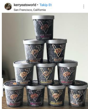
378 beğenme kerryeatworld Anyone up for some afternoon delight? 🍦 @eatvicecream and I share t... devamı