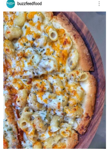
27.331 beğenme buzzfeedfood Mac & Cheese pizza 🍕

Nobody knows about the phrase “eat with your eyes” better than Instagram foodies. Food trends that go viral on Instagram have the power to draw flocks of people. If there's one thing BuzzFeed does well, it's food, which the 3.3 million followers of the @buzzfeedfood account have certainly recognised. Follow for truly beautiful and quirky photos of the best things to eat.